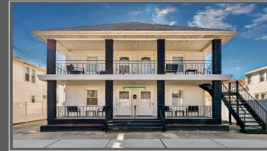
238 E Leaming Avenue #6 Wildwood, NJ