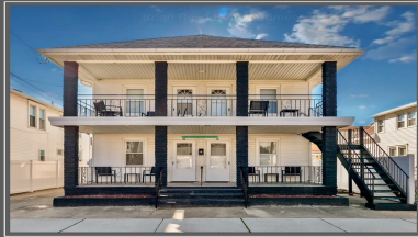
238 E Leaming Avenue #6 Wildwood, NJ