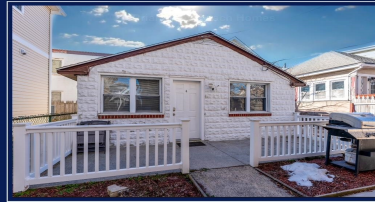
138 E Youngs Ave Wildwood, NJ Rear Cottage