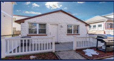
138 E Youngs Ave Wildwood, NJ Rear Cottage