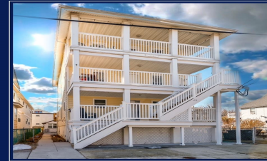
138 E Youngs Wildwood, NJ Unit 1 1st Floor