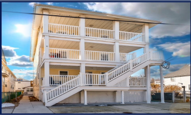
138 E Youngs Wildwood, NJ Unit 1 1st Floor