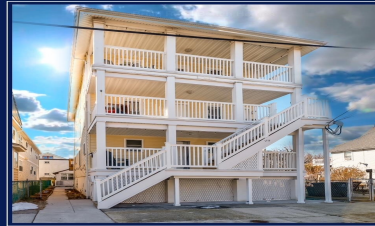
138 E Youngs Wildwood, NJ Unit 1 1st Floor