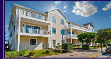
301 E Leaming Avenue Wildwood, NJ