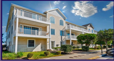
301 E Leaming Avenue Wildwood, NJ