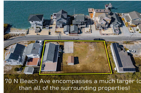
70 N Beach Ave encompasses a much larger lot than all of the surrounding properties!