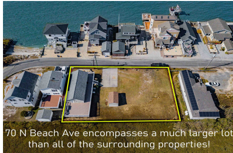
70 N Beach Ave encompasses a much larger lot than all of the surrounding properties!