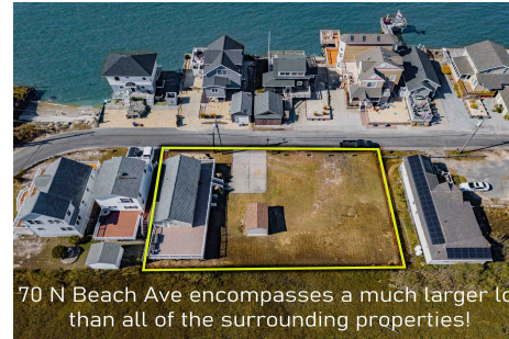
70 N Beach Ave encompasses a much larger lot than all of the surrounding properties!