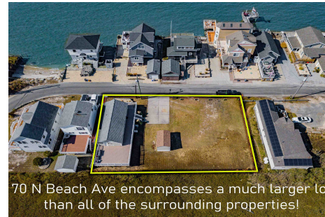
70 N Beach Ave encompasses a much larger lot than all of the surrounding properties!