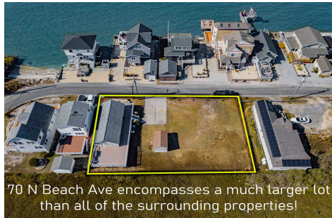
70 N Beach Ave encompasses a much larger lot than all of the surrounding properties!