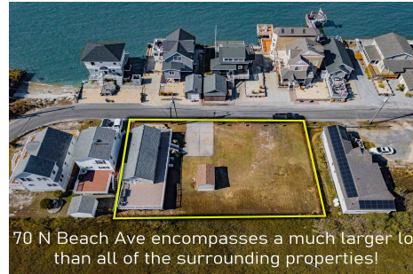
70 N Beach Ave encompasses a much larger lot than all of the surrounding properties!