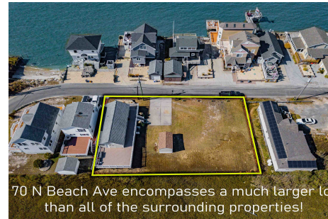
70 N Beach Ave encompasses a much larger lot than all of the surrounding properties!