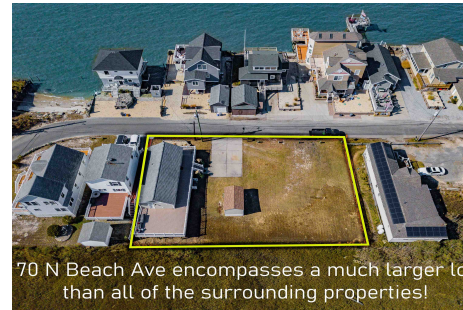
70 N Beach Ave encompasses a much larger lot than all of the surrounding properties!