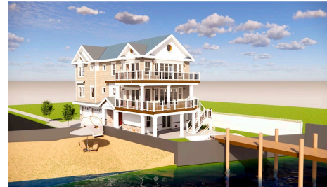
william mclees architecture