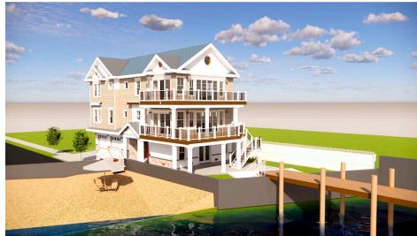
william mclees architecture