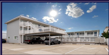
LAMPOST CONDOMINIUMS 442 E 21st Ave #114 North Wildwood, NJ