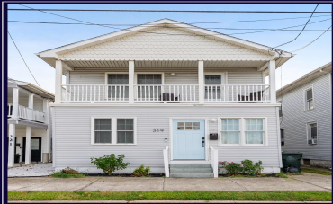
319 W BAKER AVENUE 4 Bedroom Single Family