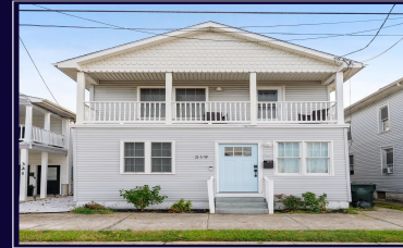
319 W BAKER AVENUE 4 Bedroom Single Family