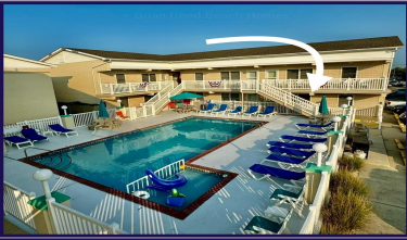
222 E 25TH NORTH WILDWOOD, NJ Erin Shores Condos