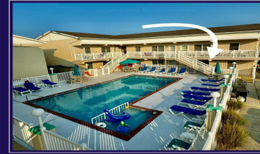
222 E 25TH NORTH WILDWOOD, NJ Erin Shores Condos