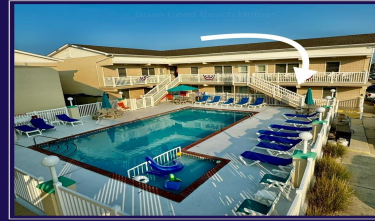
222 E 25TH NORTH WILDWOOD, NJ Erin Shores Condos