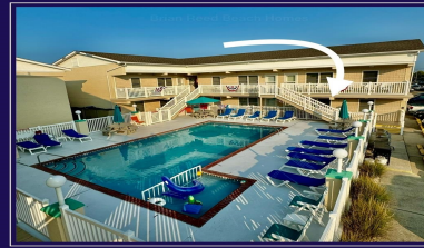
222 E 25TH NORTH WILDWOOD, NJ Erin Shores Condos