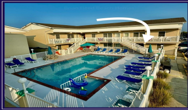
222 E 25TH NORTH WILDWOOD, NJ Erin Shores Condos