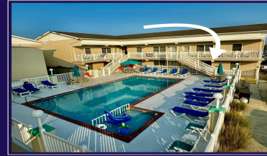
222 E 25TH NORTH WILDWOOD, NJ Erin Shores Condos