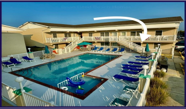
222 E 25TH NORTH WILDWOOD, NJ Erin Shores Condos