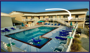
222 E 25TH NORTH WILDWOOD, NJ Erin Shores Condos