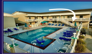
222 E 25TH NORTH WILDWOOD, NJ Erin Shores Condos