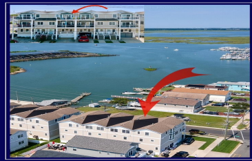
3403 SUSQUEHANNA AVENUE 4 Bedroom Bayview Townhouse