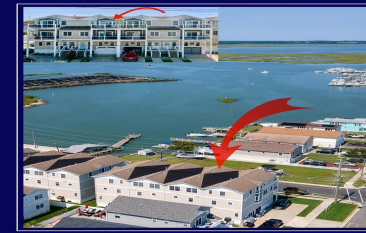
3403 SUSQUEHANNA AVENUE 4 Bedroom Bayview Townhouse