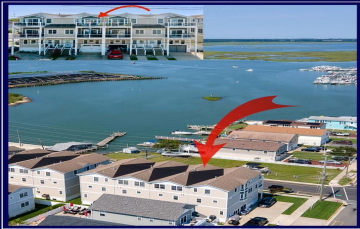
3403 SUSQUEHANNA AVENUE 4 Bedroom Bayview Townhouse