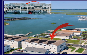
3403 SUSQUEHANNA AVENUE 4 Bedroom Bayview Townhouse