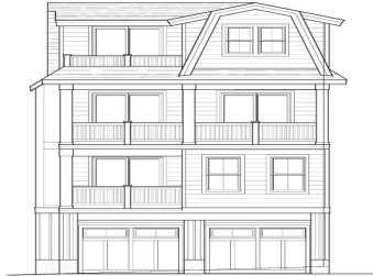
PARK ROAD ELEVATION