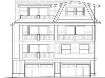
PARK ROAD ELEVATION