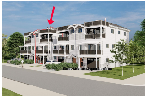
These plans are Approximations