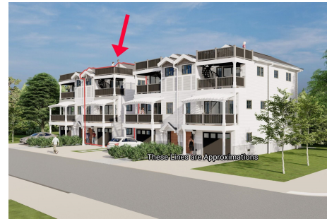
These plans are Approximations