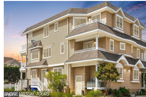
SHORE VIRTUAL TOURS