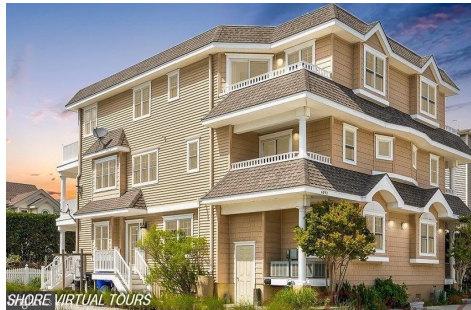
SHORE VIRTUAL TOURS