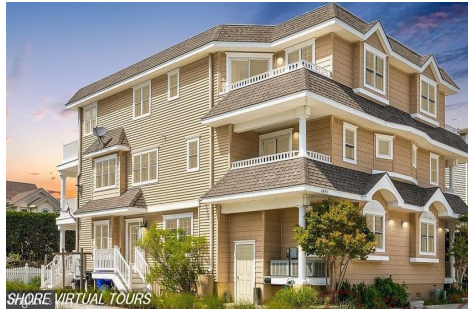
SHORE VIRTUAL TOURS