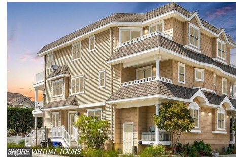
SHORE VIRTUAL TOURS