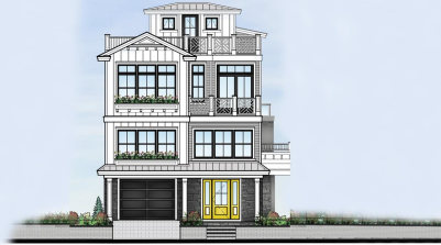
8306 SUNSET DRIVE - 36'-0" (33'-100% OF LOT AREA)