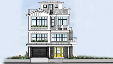
8306 SUNSET DRIVE - 36'-0" (33'-100% OF LOT AREA)