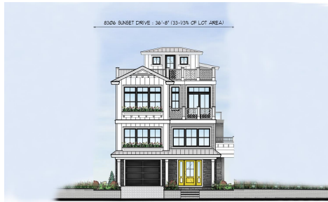
8306 SUNSET DRIVE - 36'-0" (33-1/3% OF LOT AREA)