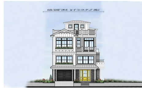
8306 SUNSET DRIVE - 36'-0" (33-1/3% OF LOT AREA)