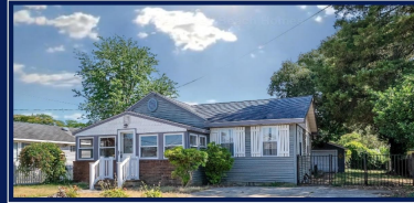
104 W ATLANTIC AVENUE VILLAS, NJ Bayside Beauty