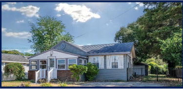
104 W ATLANTIC AVENUE VILLAS, NJ Bayside Beauty