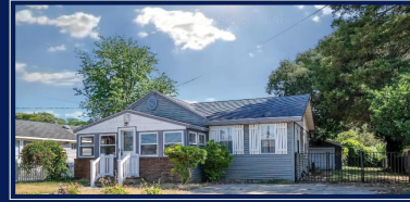
104 W ATLANTIC AVENUE VILLAS, NJ Bayside Beauty