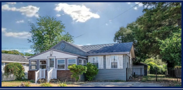
104 W ATLANTIC AVENUE VILLAS, NJ Bayside Beauty