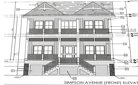
SIMPSON AVENUE (FRONT) ELEVATION