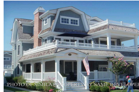
PHOTO OF SIMILAR PROPERTY BY SAME DEVELOPER