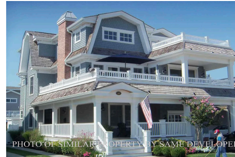
PHOTO OF SIMILAR PROPERTY BY SAME DEVELOPER