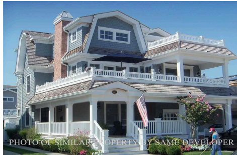
PHOTO OF SIMILAR PROPERTY BY SAME DEVELOPER