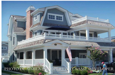
PHOTO OF SIMILAR PROPERTY BY SAME DEVELOPER