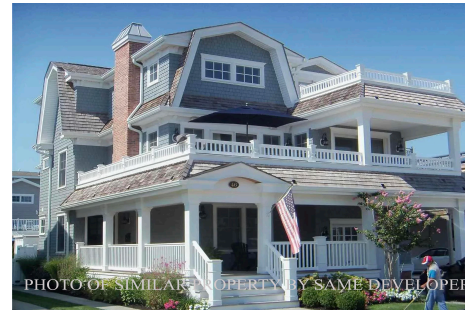
PHOTO OF SIMILAR PROPERTY BY SAME DEVELOPER