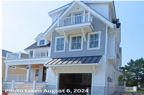
Photo taken August 6, 2024