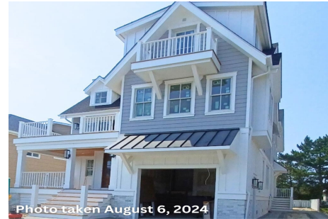
Photo taken August 6, 2024