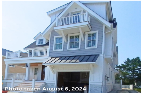
Photo taken August 6, 2024