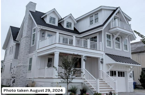
Photo taken August 29, 2024