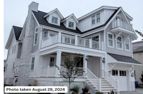
Photo taken August 29, 2024