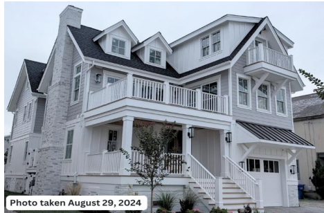
Photo taken August 29, 2024