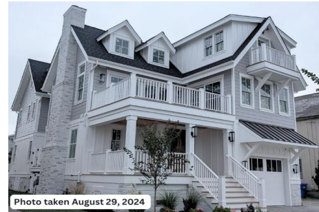
Photo taken August 29, 2024