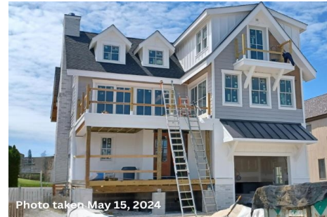
Photo taken May 15, 2024