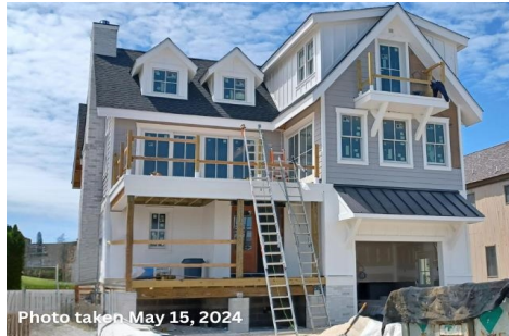
Photo taken May 15, 2024