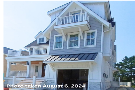
Photo taken August 6, 2024