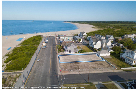
Property depicted on this site is an approximate visual representation for illustrative purposes only.