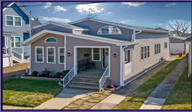
6003 PARK BOULEVARD Wildwood Crest, NJ