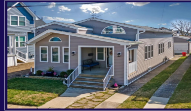
6003 PARK BOULEVARD Wildwood Crest, NJ