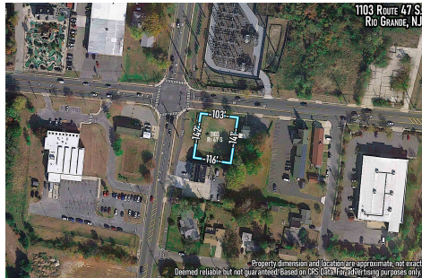
1103 Route 47 S, Rio Grande, NJ