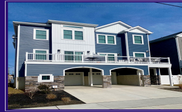
308 W 19TH AVENUE NORTH WILDWOOD 4 Bedroom Bayview Townhouse