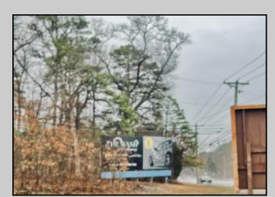
45 White Horse Galloway Township, NJ 08205