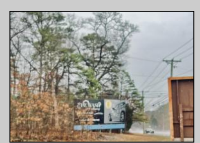
45 White Horse Galloway Township, NJ 08205