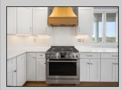
3300 Wesley Ave Ocean City, NJ 08226