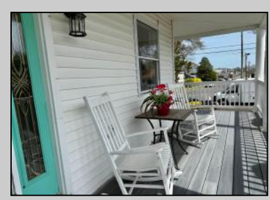
99 Holly Hills Somers Point, NJ 08244