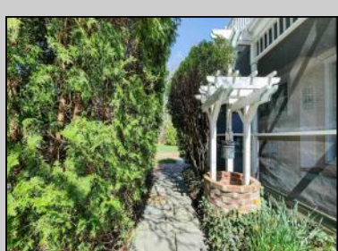
418 Shore Rd. Beesleys Point, NJ 08223